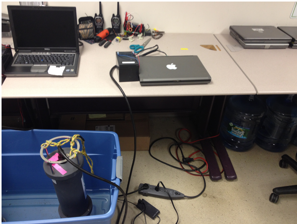
Figure 2: connect to laptop