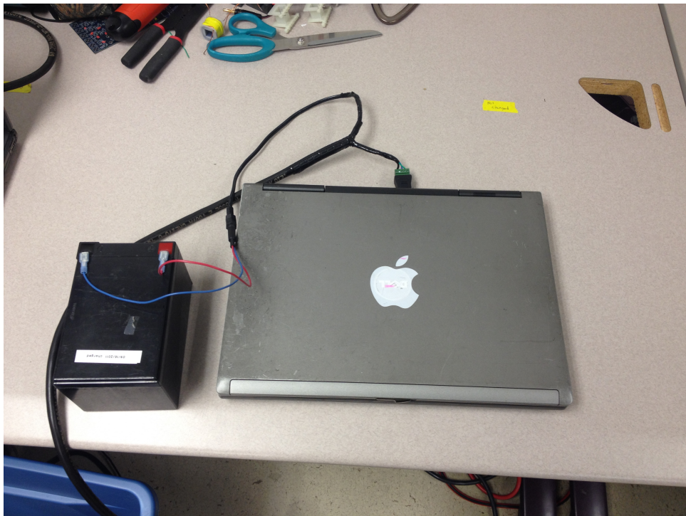
Figure 3: power on